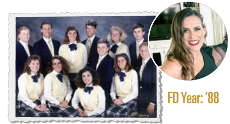
FD Year: '88

I spend much of my free time investing in the youth of Kern County. I believe that team sports and athletics in general provide a great support system for today's youth. Coaches and mentors can help develop valuable characteristics like hard work, discipline, selflessness, humility, and the expectation of succeeding at whatever it is you work hard to accomplish. Coaching allows me to spend time with my kids, doing what they love.