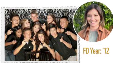
FD Year: '12

I served for over twenty years on the Jim Burke Education Foundation and as a Dream Builders team advisor. I have also served on the Golden Empire Gleaners board since 2006 and I am the current board chair.