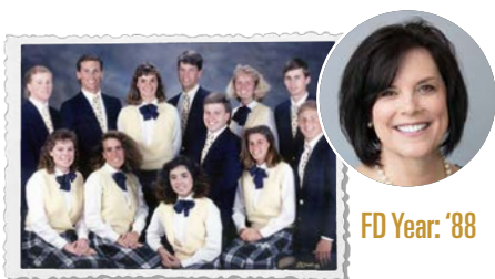
FD Year: '88

My favorite organization I have worked with over the years is St. Vincent de Paul. We built the homeless center, and I love being on the board and making sure the mission of feeding clothing and taking care of those most in need. Paying it forward.