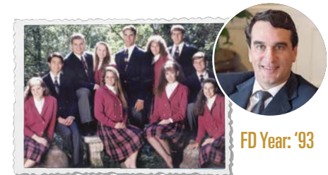
FD Year: '93

I've been involved with two non-profits that hold special significance for me: the Jim Burke Education Foundation and the Kern County Basque Club (KCBC). Despite their differences, both organizations share a common purpose.