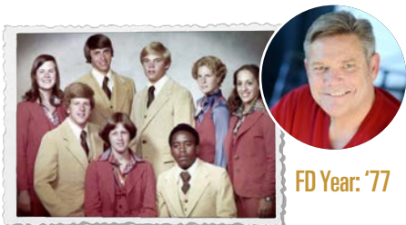
FD Year: '77