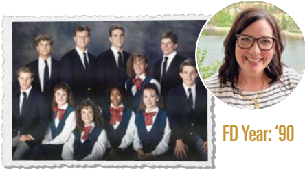
FD Year: '90

Grab a pen and have fun trying to connect alumni's recent photo on the right with their graduation photo on the left!