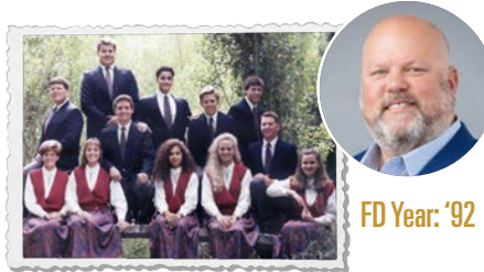
FD Year: '92

It's been 35 years since I was part of this organization, and I would hope I have carried on that mantra in a small way. As a teacher, service is the center of my life. I always look for families that need a little extra support and love each year and make it a priority to help when needed. Our family has served others through our church outreach programs. I also came back to serve as a Ford Dream Builder advisor and thoroughly enjoyed my time working with teams to serve our community.